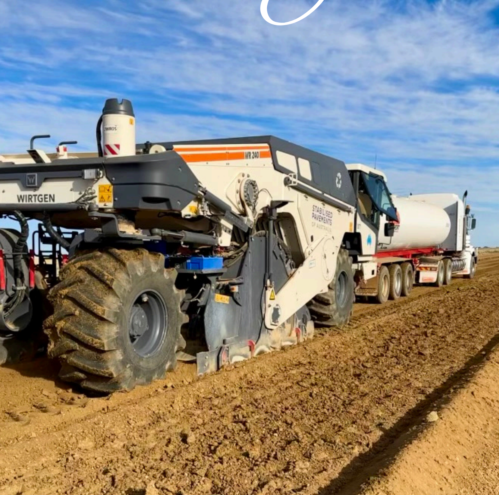
Bimmerah Isisford Road