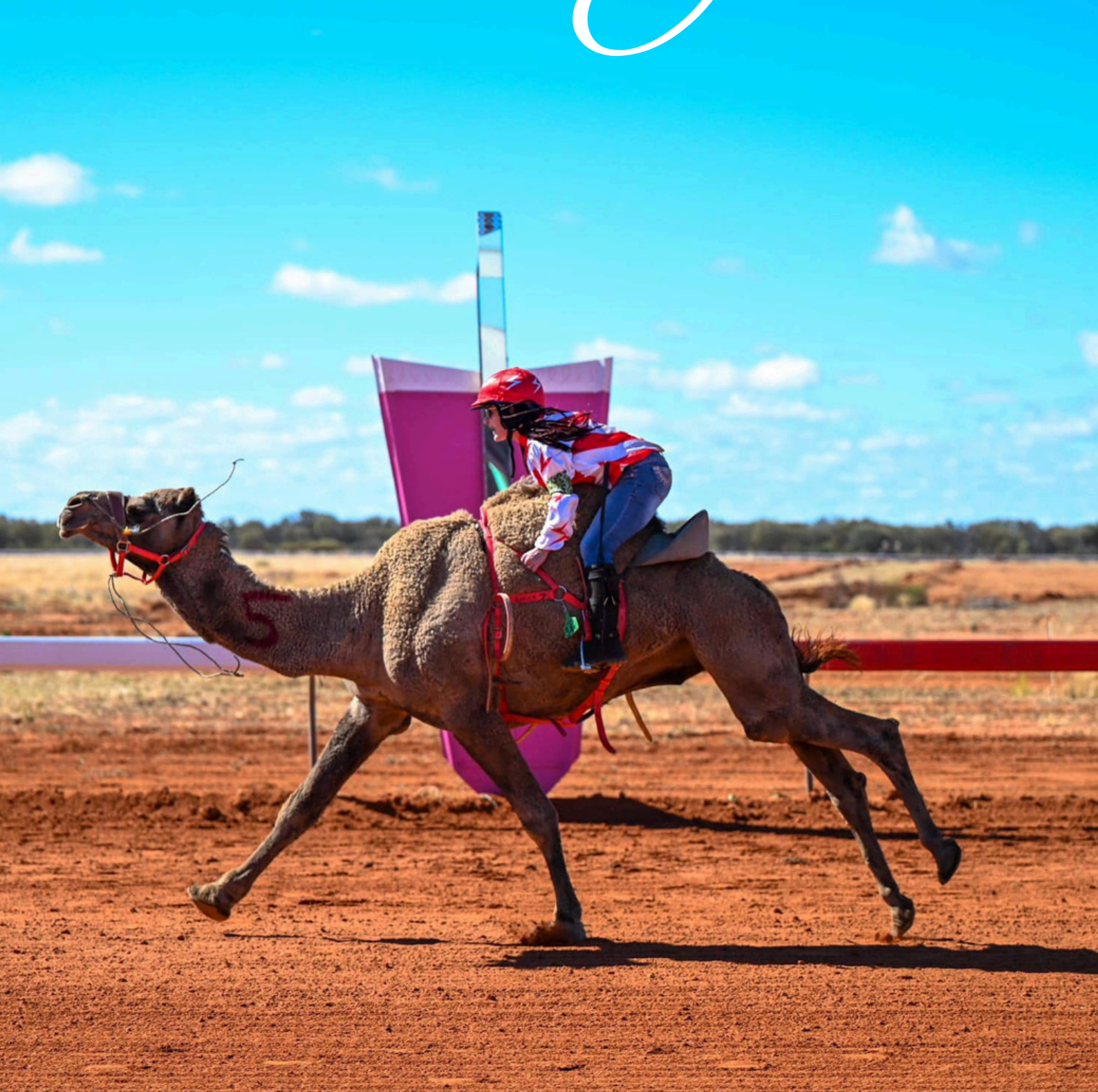
Jundah Camel Races