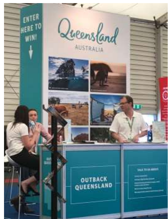
Right: The Queensland Stand at the Victorian Caravan and Camping Show, featuring Outback Queensland