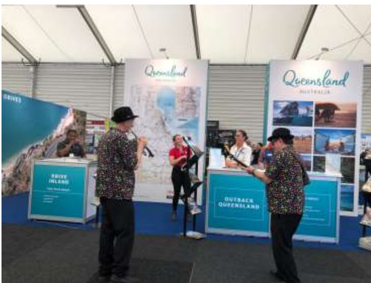
Above: The Outback Queensland team enjoying the entertainment at the Victorian Caravan and Camping Show

The tourist season begins soon in the Outback, and hopefully our presence at the Victorian Caravan and Camping Show will contribute to it being a bumper year in Barcoo Shire.