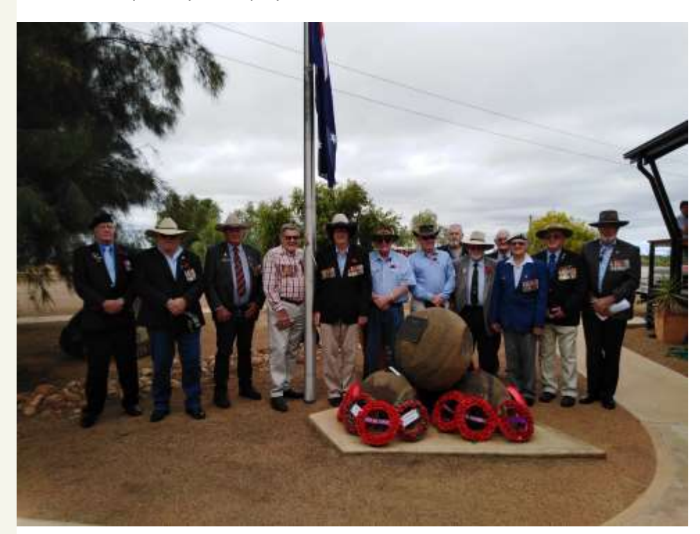
Standown Park Veterans at Stonehenge Anzac Service

Stonehenge was also kindly gifted an ANZAC figure ornament from the veterans, now proudly on display at the information centre.