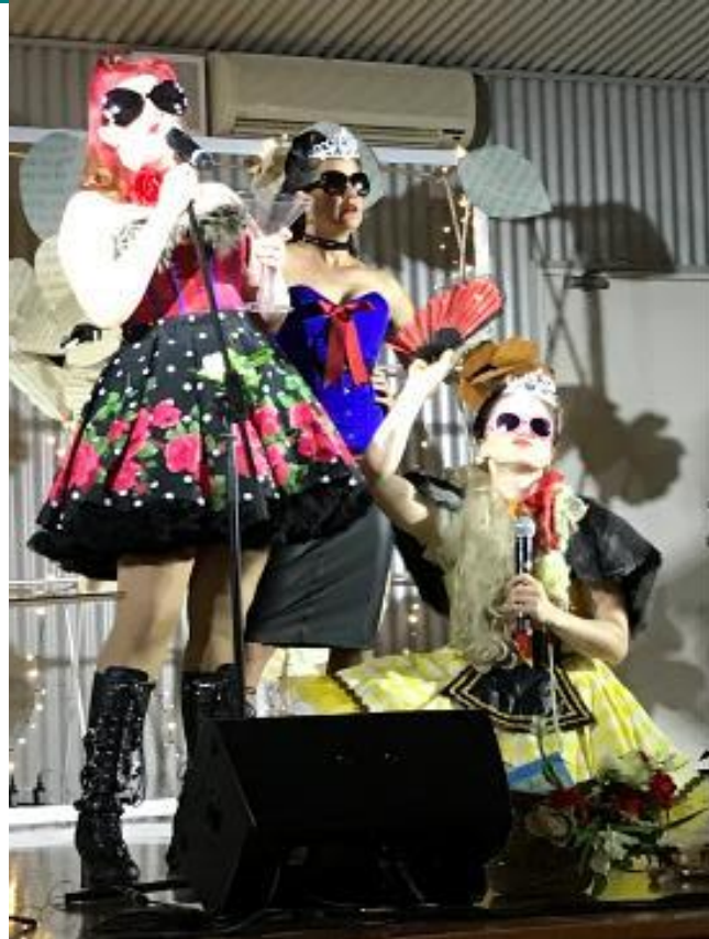
The costumes and antics of Babushka were hilarious

Well I don't think anyone really knew what to expect from the arTour show held in Windorah on Saturday 27th October. But I don't think anyone walked away disappointed.