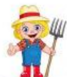
Illustration © 2018/2019