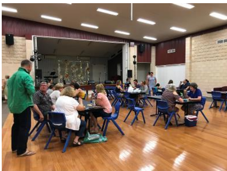
The stage all set and the crowd enjoying dinner before the show starts