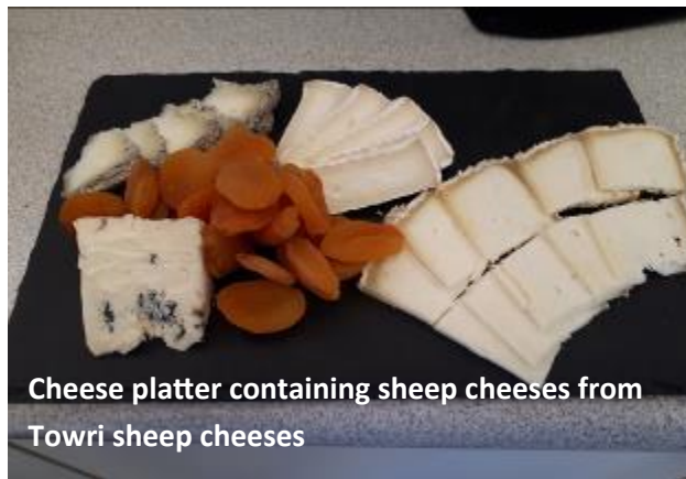
Cheese platter containing sheep cheeses from Towri sheep cheeses