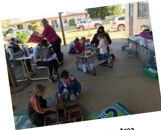
Windorah playgroup with Remote Area Family Services