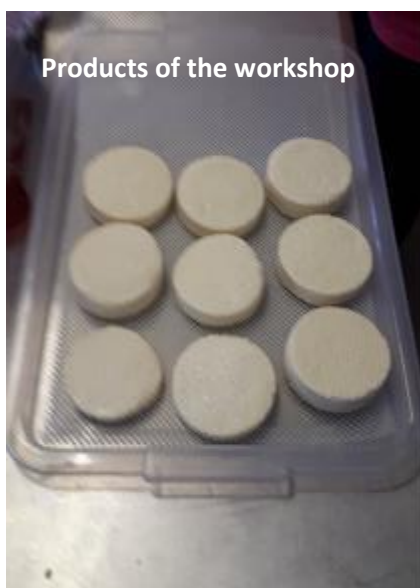
Products of the workshop