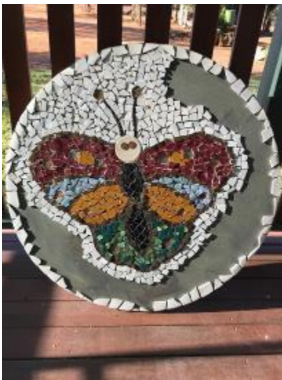
Left: This butterfly table top didn't get completed, hopefully it will be completed soon