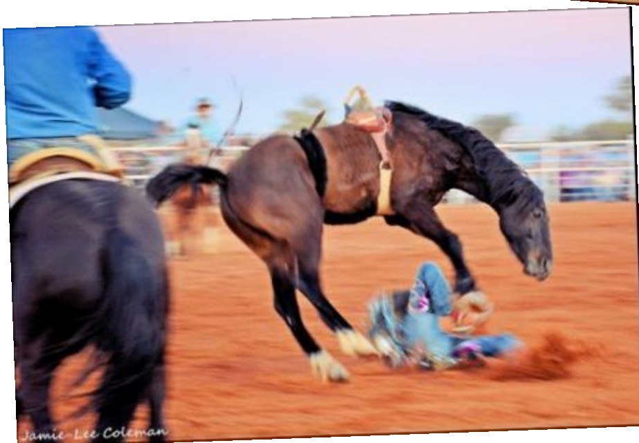
Images taken at Stonehenge Rodeo