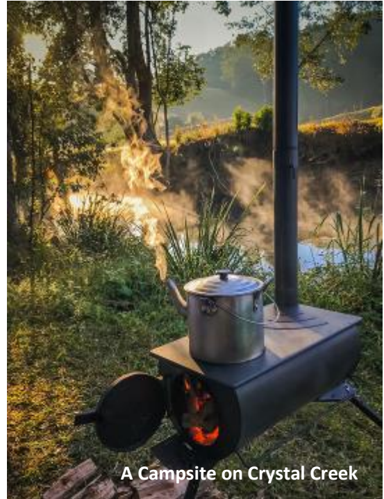
A Campsite on Crystal Creek