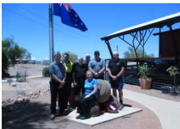
We were joined by staff from the over the horizon radar site on Remembrance Day