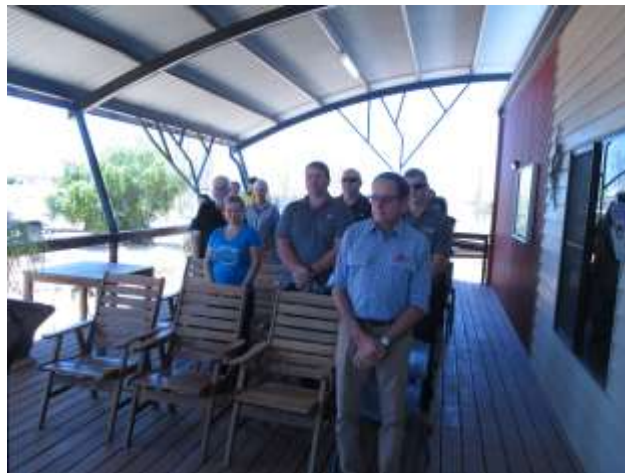
Remembrance Day Service