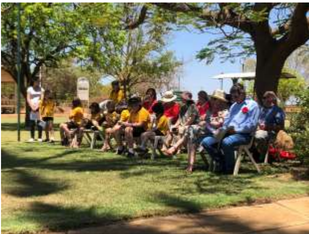
Remembrance Day Service