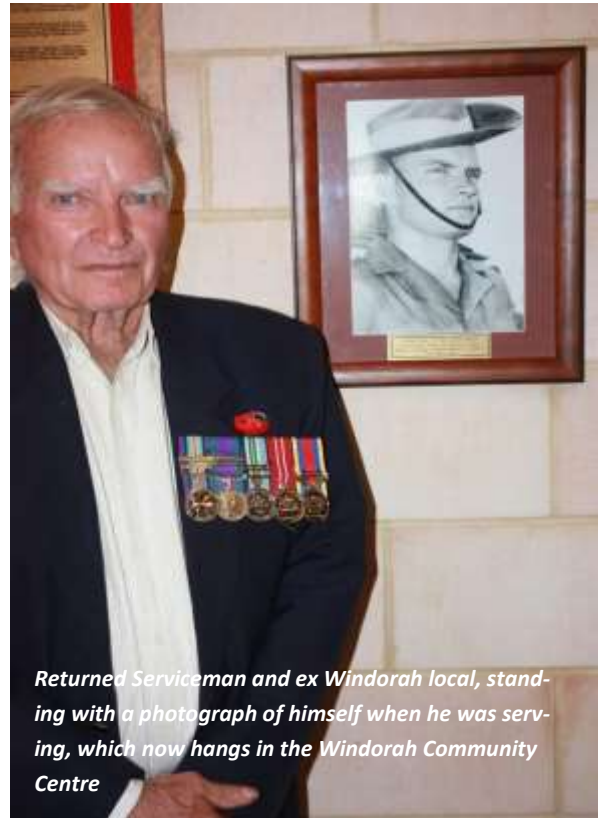
Returned Serviceman and ex Windorah local, standing with a photograph of himself when he was serving, which now hangs in the Windorah Community Centre